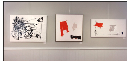
Best in Show: Donald Sunshine - Restoration, Trio, Passage