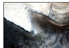
2nd Place: Sammy Allen - High Tide